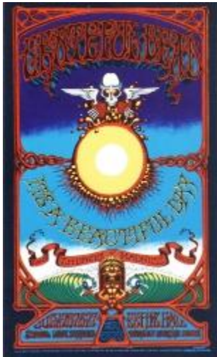
The Hawaiian AOXOMOXOA

Called the "Hawaiian AOXOMOXOA," this is a poster for a show that never took place. Rick Griffin hand carried 25 back from Hawaii himself on the plane. The printer destroyed all the other copies because he was never paid for the gig. Of the 25 that were salvaged, there were four printer's proofs, three on the same stock as the posters and one on a slightly different stock. These 25 were the only originals of this most classic poster. There have been two reprints, one that is smaller.